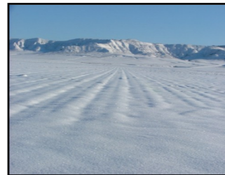
BeneTerra SDI systems operate in winter by capturing the heat latent in the coalbed water. The systems are managed to replace subsoil moisture and move salts deeper into the soil during winter.