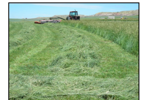
Swathing grass hay produced with coalbed water through SDI

Effluent and produced waters require care in their application to the land. If done properly, beneficial use is a win-win solution for all concerned. BeneTerra cares for the land while putting water to a higher use.