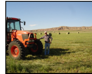
Increased hay production along with available stock water has allowed some ranchers to maintain and even expand their herds during drought.